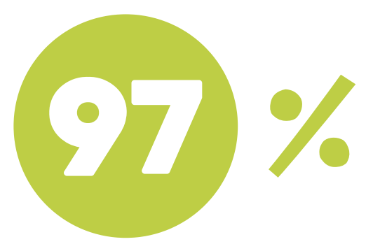
OF THE GROUND WATER BEING UNFIT FOR HUMAN CONSUMPTION. 25 26